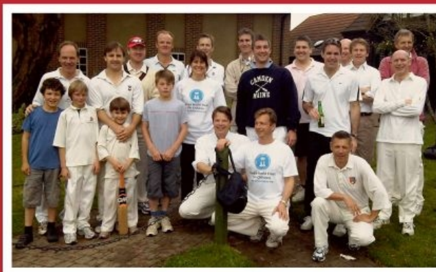
Pictured – the Amesbury Dads cricket squad

Not to be outdone by their children, the 'Amesbury Dads' also played their part this year by taking part in a charity cricket match. The day was a great success (despite the almost monsoon-like conditions)!