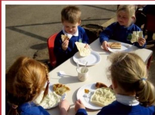
Children at Grayswood Infant School enjoy their Indian inspired lunch!

We are very fortunate to enjoy the support of a number of UK schools who fundraise throughout the school year on our behalf and sponsor several of our children. But it's not just about fundraising. The children in our 'partner' schools in the UK benefit by learning all about India; Indian culture, food, history and climate. They really enjoy receiving letters from the children they sponsor in India and are very curious to learn all about how they live, what they eat, what they like to play and even how they get to school. In return, our Trust children are proud to be supported by people their own age and love hearing from all their friends in the UK.