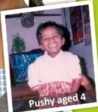
Pushy aged 4